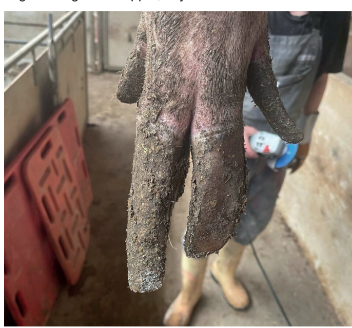
Jan Volmer assesses that there are sores in all herds that require hoof trimming. Here, treatment is definitely needed.