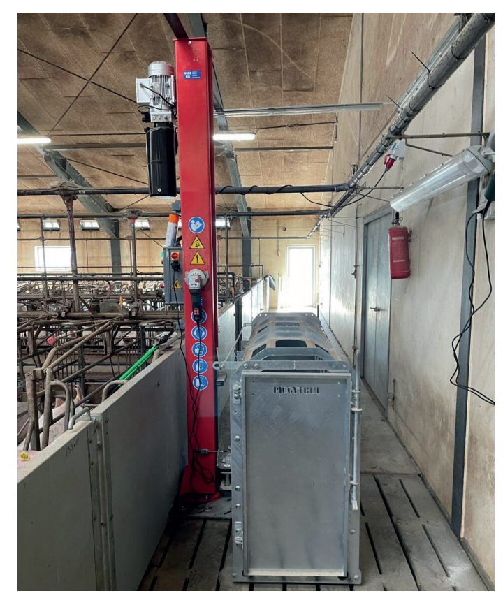
It is advisable to place the hoof trimming box in a place that is appropriate in relation to the internal logistics of the stable facility.