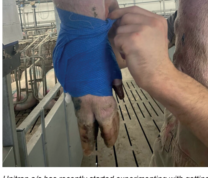
Unitron a/s has recently started experimenting with getting people to put bandages on hoof blisters and damage to the sows. It saves some sows from being euthanized so that they can be sent to slaughter instead.

The PiggyTrim hoof trimming box is operated with two buttons and there are no locking mechanisms to remember. The box locks automatically when it is raised. It is also a legal requirement that the safety equipment is checked once a year.