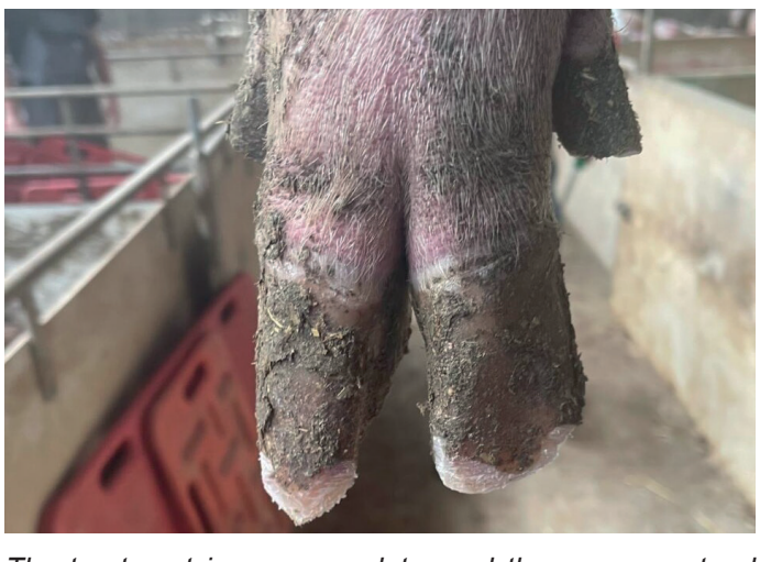
The treatment is now complete, and the sow can stand and walk better on her legs. She can now rise more easily and get to the drinking water, allowing her to produce enough milk for the piglets.

If you want to work professionally here, you must look for growths on the hooves and hoof balls, cracks in the edge of the hoof and the length of the hooves.